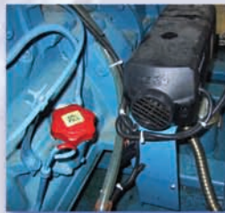
Diesel fuel powered heater inside enclosure