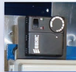
Thermostat to control the temperature inside the enclosure