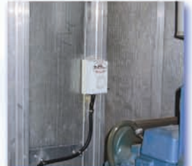
Built-in battery charger