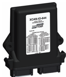
EXPANDABLE I/O OPTIONS